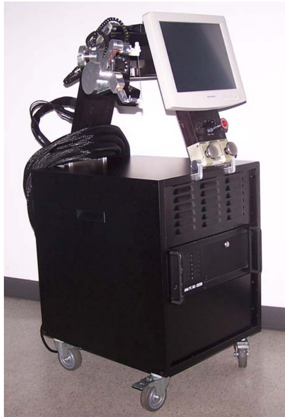
Figure 2: Revolving Needle Driver on the AcuBot robot