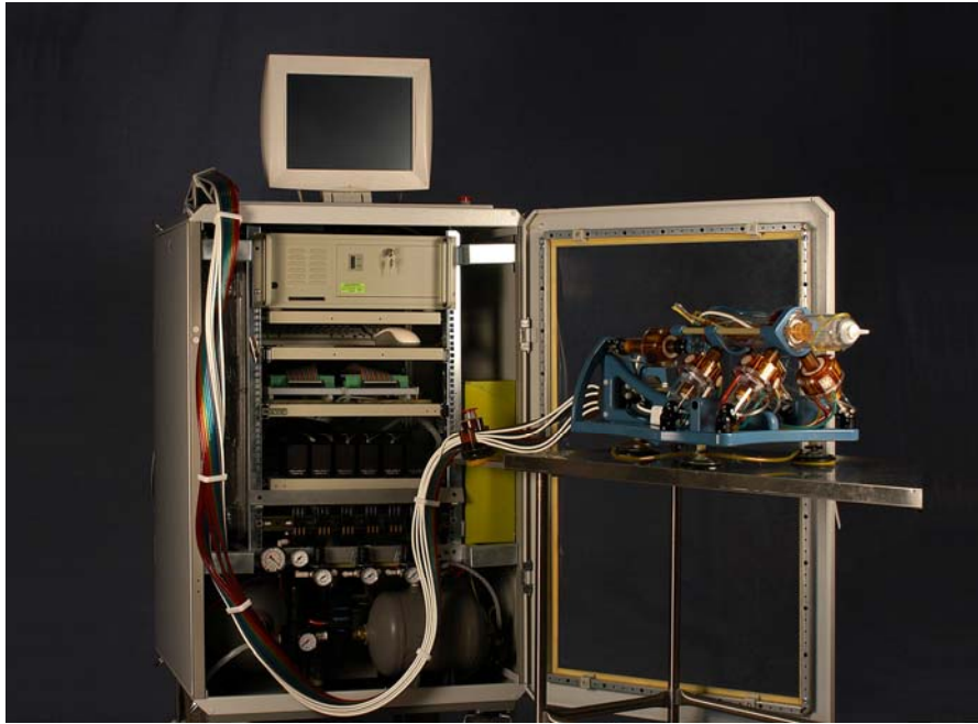
Figure 3: MrBot robot for MRI guided prostate interventions

for performing various needle interventions. The first driver was developed for fully automated low dose (seed) brachytherapy [41] (Figure 3).