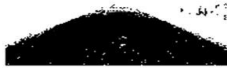
Figure 2b output image of the autonomous vehicle

The evaluation schemes used to test the output image of the system with filtering algorithm are expressed in equation (24)–(29). These evaluation schemes illustrate the measurable rate of how successful the optimized road recognition system has improved the navigation of the autonomous vehicles.